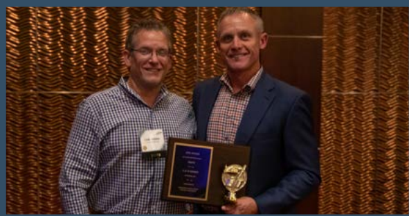
PRINT C & W HOMES VICKSBURG, MS