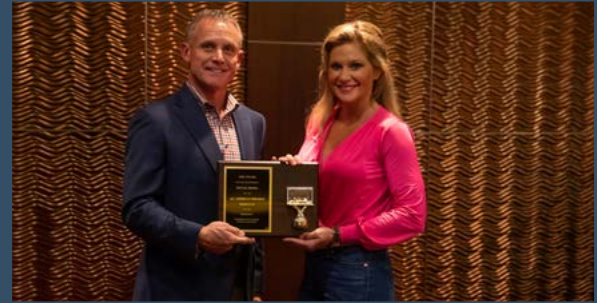
SOCIAL MEDIA ALL AMERICAN HOUSING BROOKHAVEN, MS