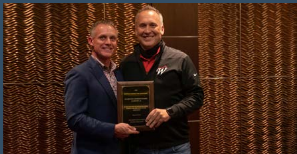
MANUFACTURER OF THE YEAR HAMILTON HOMEBUILDERS HAMILTON, AL