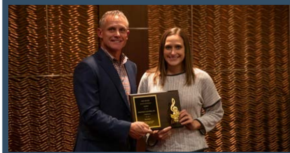
RADIO MAGNOLIA ESTATES VICKSBURG, MS