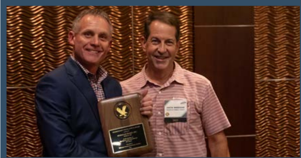
45 YEARS OF MEMBERSHIP WINDHAM HOMES, INC. TUPELO, MS