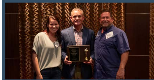
TELEVISION SOUTHERN COLONEL HOMES, INC. HATTIESBURG, MS