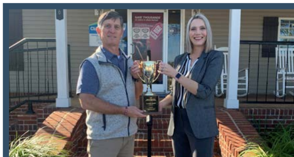
MOST ATTRACTIVE SALE CENTER CLAYTON HOMES McCOMB, MS