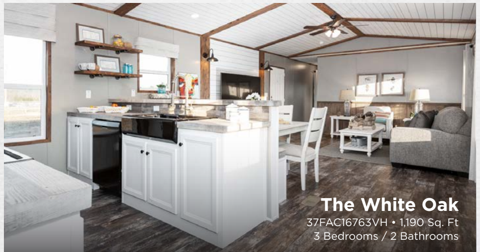
The White Oak 37FAC16763VH • 1,190 Sq. Ft 3 Bedrooms / 2 Bathrooms