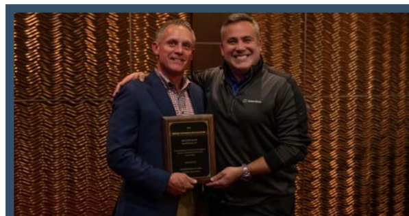
SERVICE/SUPPLIER OF THE YEAR RELIANT BANK KNOXVILLE, TN