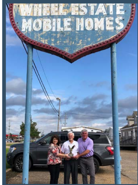
50 YEARS OF MEMBERSHIP WHEEL ESTATE HOMES, INC. TUPELO, MS