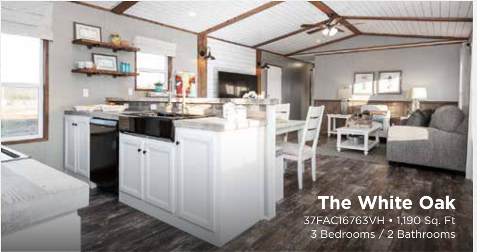
The White Oak 37FAC16763VH • 1,190 Sq. Ft 3 Bedrooms / 2 Bathrooms

2600 HWY 226 • Savannah, TN 38372 • 731-925-1902 • cmhsavannah.com