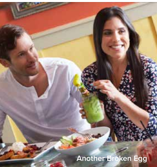
Another Broken Egg