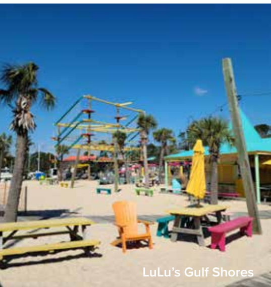
LuLu's Gulf Shores