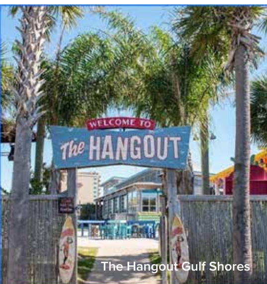
The Hangout Gulf Shores

The Hangout Gulf Shores (American, Seafood, Bar, Open Air Seating, Games & Activities) 101 E Beach Blvd Gulf Shores, AL 36542 251-948-3030