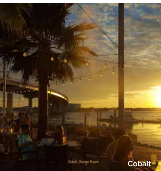
Cobalt Orange Beach

22641 Canal Rd Orange Beach, AL 36561-3825 251-981-1833